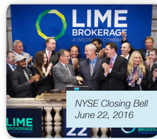
NYSE Closing Bell June 22, 2016