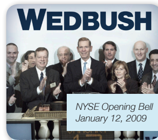
NYSE Opening Bell January 12, 2009